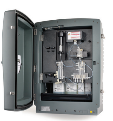
Orthophosphate concentration in the activated sludge tank effluent had previously fluctuated from 0.6 to 3.3 mg/l

as P with an average concentration of 2.2 mg/l as P. The range of the Hach Phosphax sc LR instrument is 0.015 to 2 mg/l and as a result, site staff were requested to attempt to reduce the ASP effluent to circa 0.5mg/l for the duration of the trial.